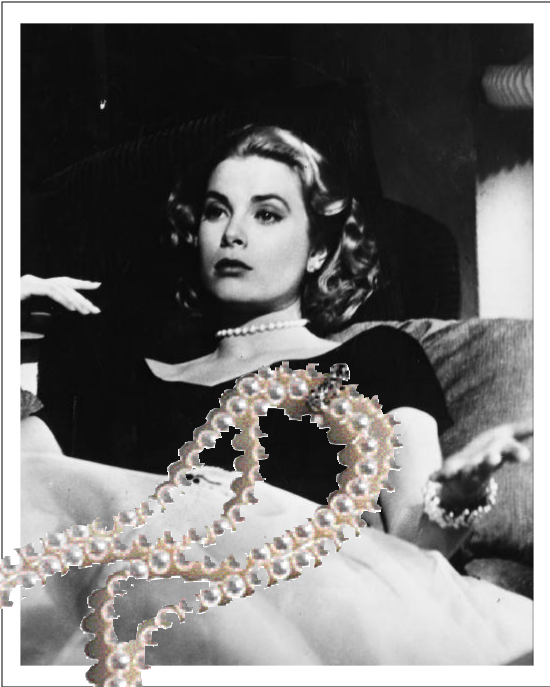
ETERNAL GRACE: The dignity and elegance of pearls attain high drama with a diamond and pink sapphire encrusted clasp.