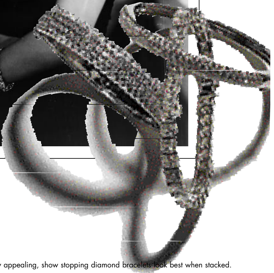
WRIST ACTION: Armed and dangerously appealing, show stopping diamond bracelets look best when stacked.