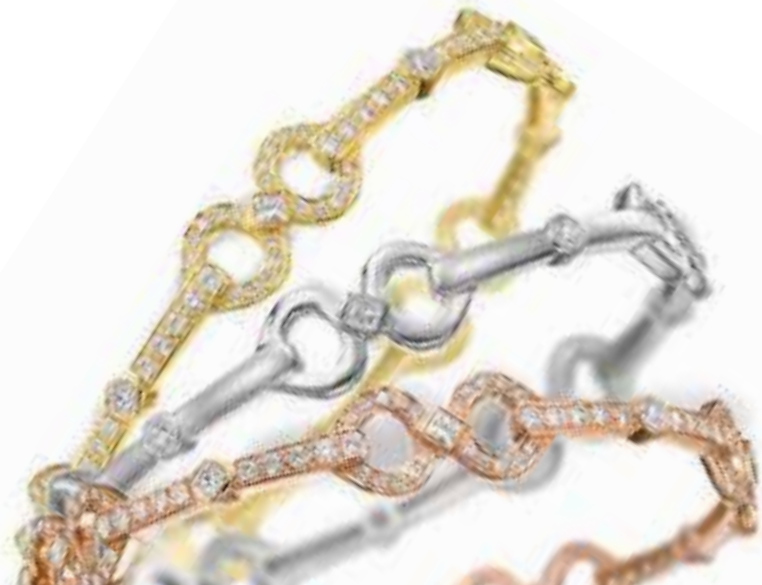
GALLOP BANGLES IN 18K YELLOW, WHITE, AND ROSE GOLD WITH DIAMONDS / GUMUCHIAN