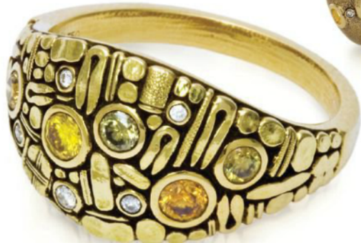
18K gold dome-shaped ring with various shapes in the metal and round gemstones and diamonds