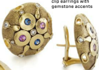
18K gold circular Omega clip earrings with gemstone accents