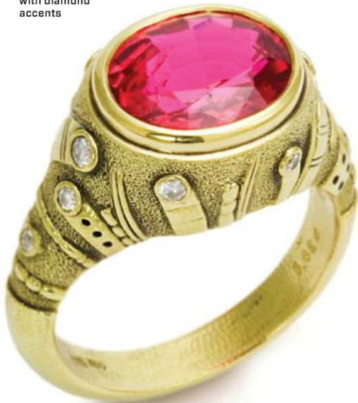
18K gold center stone oval ring with diamond accents