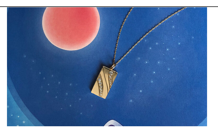
The Luminaries Shining Bright at Couture