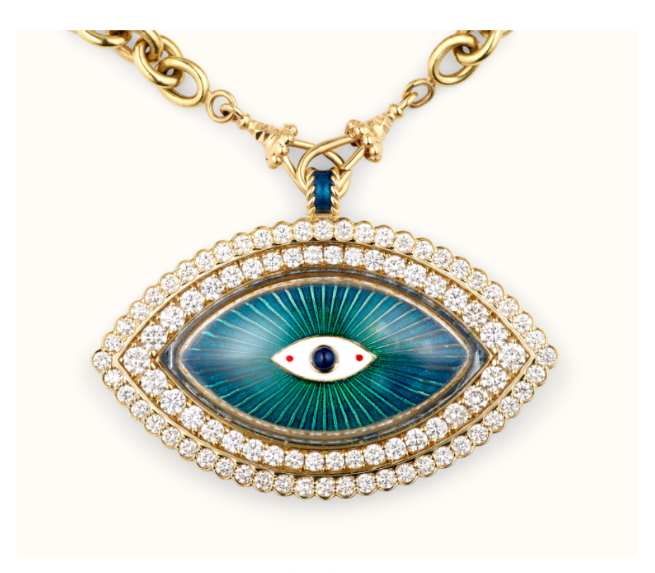
Protective Eye pendant in 18-karat gold with enamel.