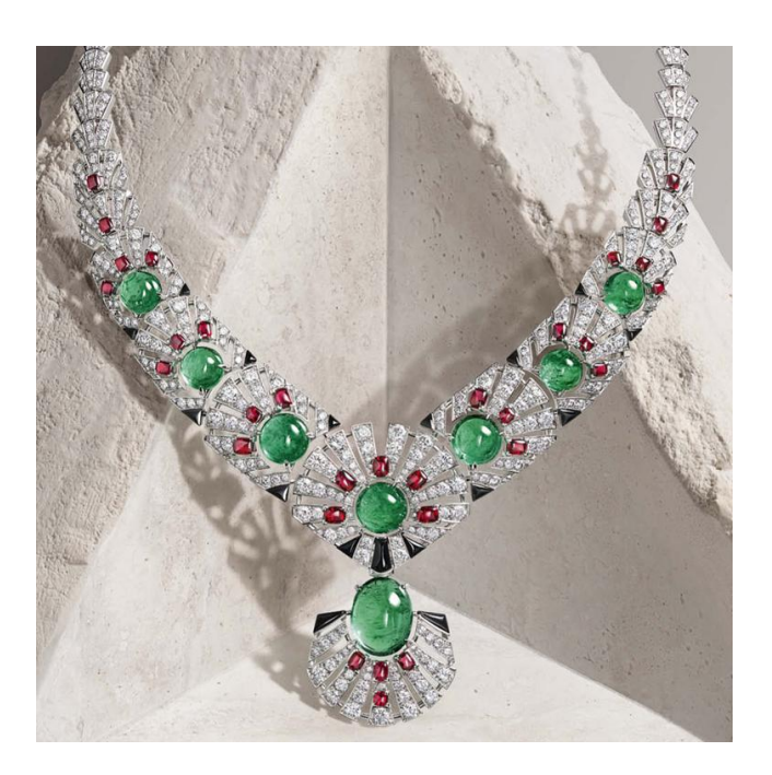
ARTICLE Some like it Haute: high jewellery from Paris Couture 2023